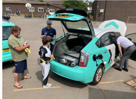
Maidenhead Roadshow Day – 25 June 22